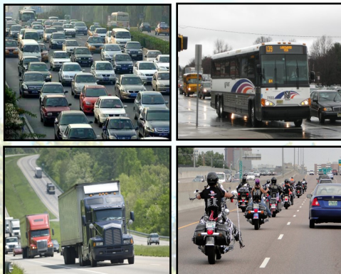
On-road mobile sources are a major contributor to air pollution in northern New Jersey.

Transportation plans and programs impact air pollution levels by affecting: