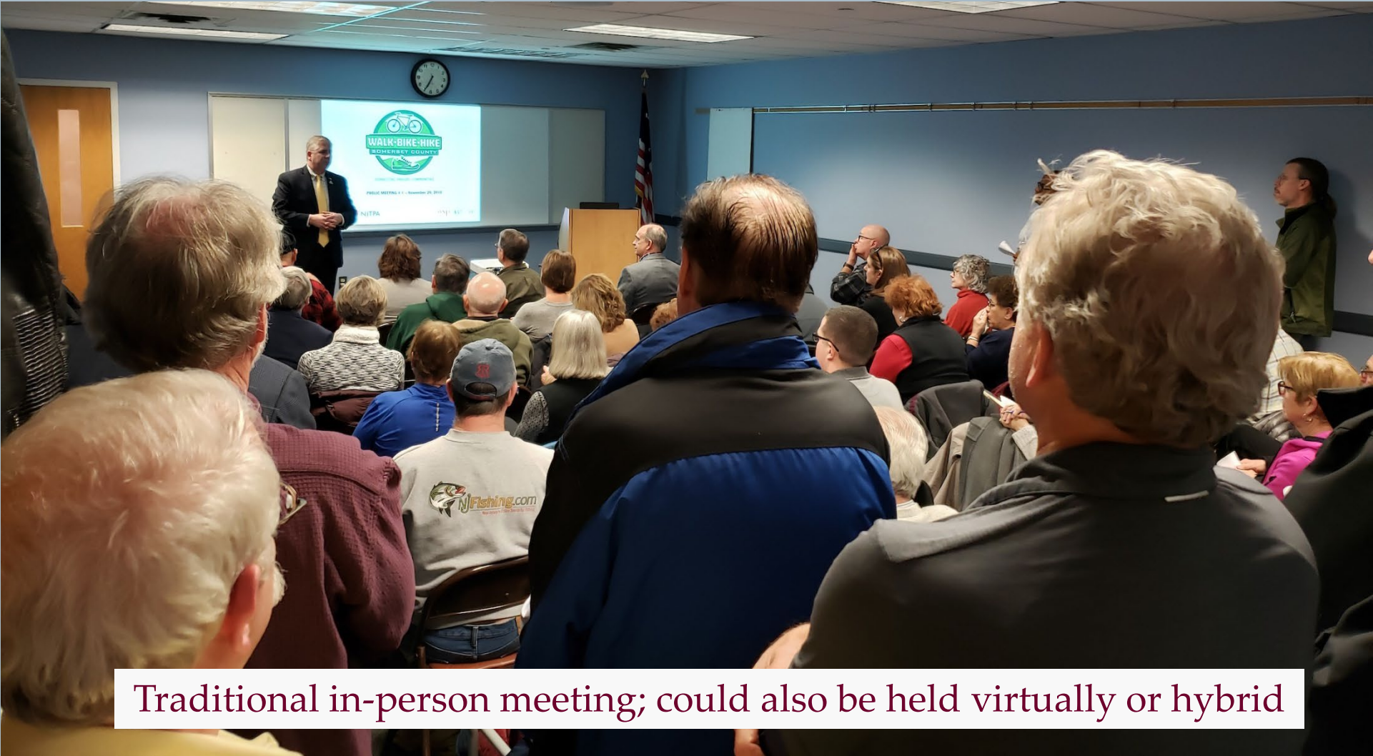
Traditional in-person meeting; could also be held virtually or hybrid