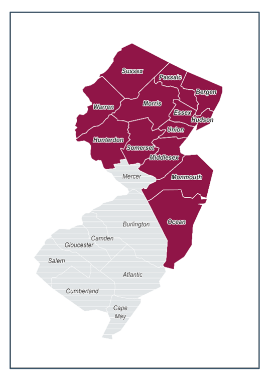
Figure 1: Map of the NJTPA's jurisdiction.

The NJTPA<sup>2</sup> is the federally authorized Metropolitan Planning Organization (MPO) for the 13-county northern New Jersey region (Figure 1). The NJTPA serves a region of 7 million people, one of the largest MPO regions in the country. The NJTPA evaluates and approves proposed transportation improvement projects. It also provides a forum for cooperative transportation planning efforts, sponsors transportation and planning studies, assists county and city planning agencies, and monitors the region's compliance with national air quality goals. The 20-member NJTPA Board of Trustees is composed of local elected officials from each of the region's 13 counties and from the region's two largest cities, Newark and Jersey City. The board also includes representatives from the Governor's Office, the New Jersey Department of Transportation (NJDOT), the Port Authority of New York and New Jersey